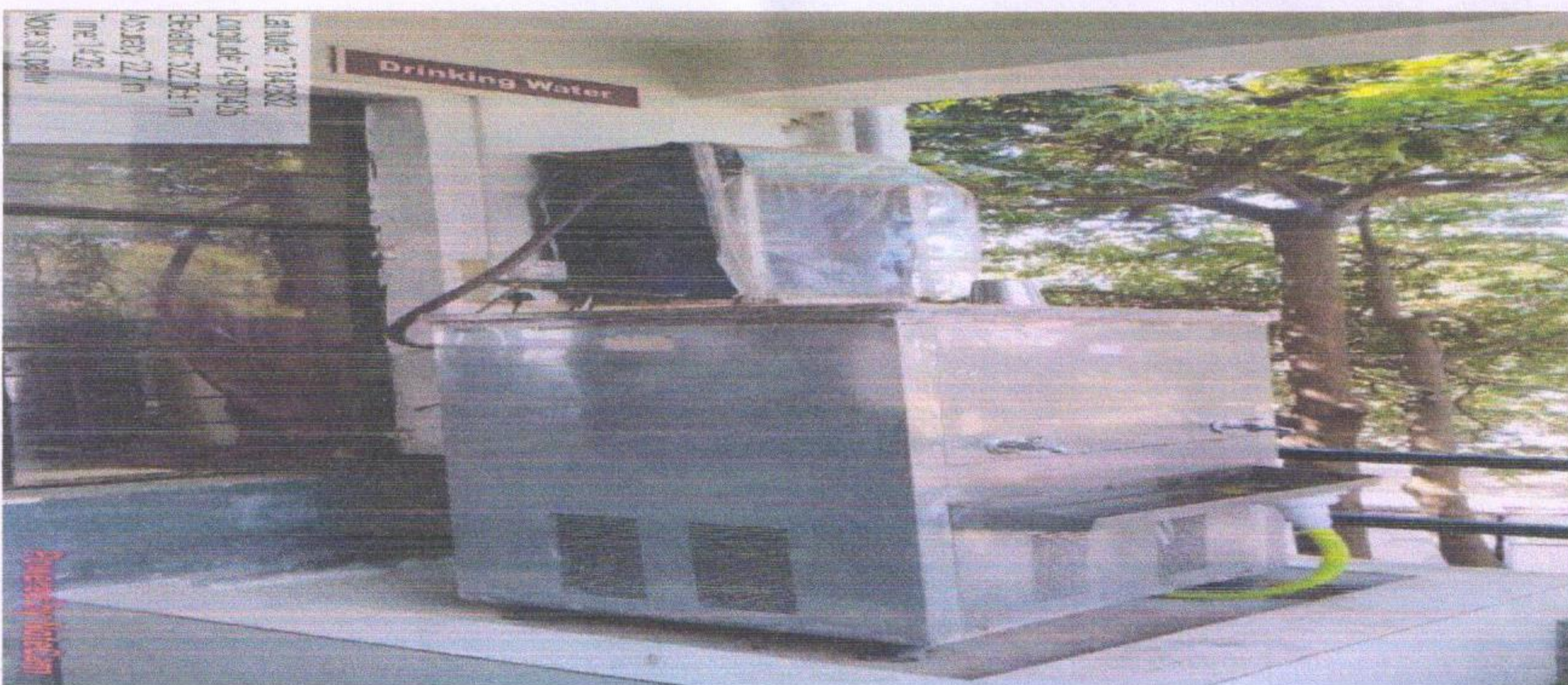
RO drinking water