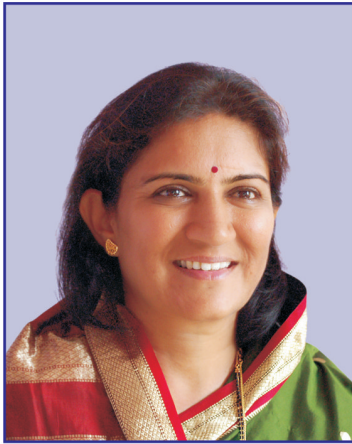
Hon. Shrilekha P. Paatil